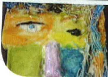
Year 8 Art