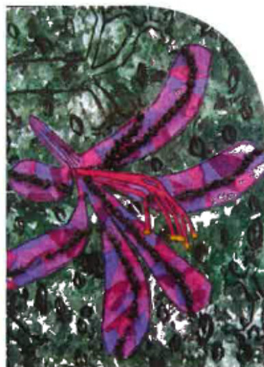
Claire Groves [9]