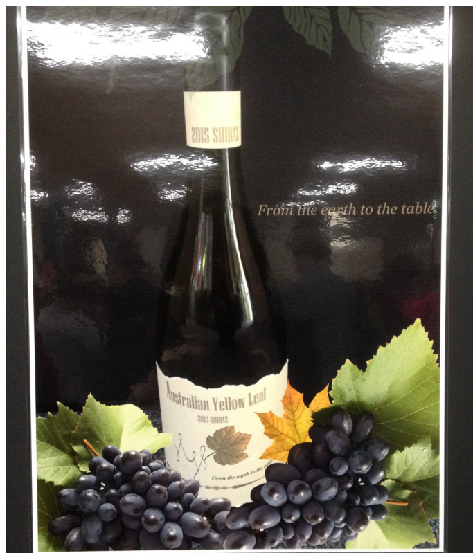
Cindy Wei's winning design

School tours are also conducted fortnightly and bookings are essential. PH: 9836 0555.