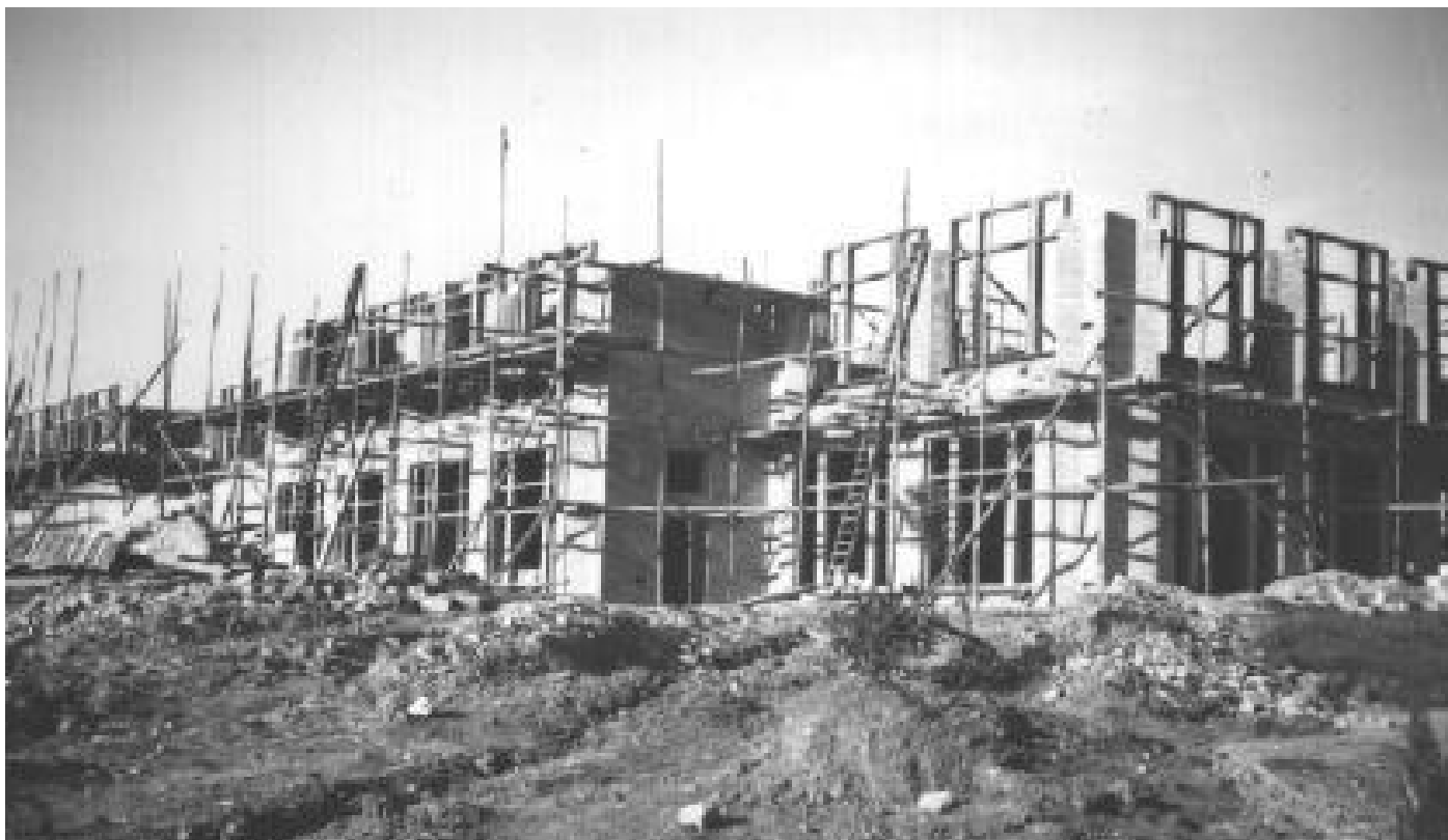
Camberwell High School under construction in 1940