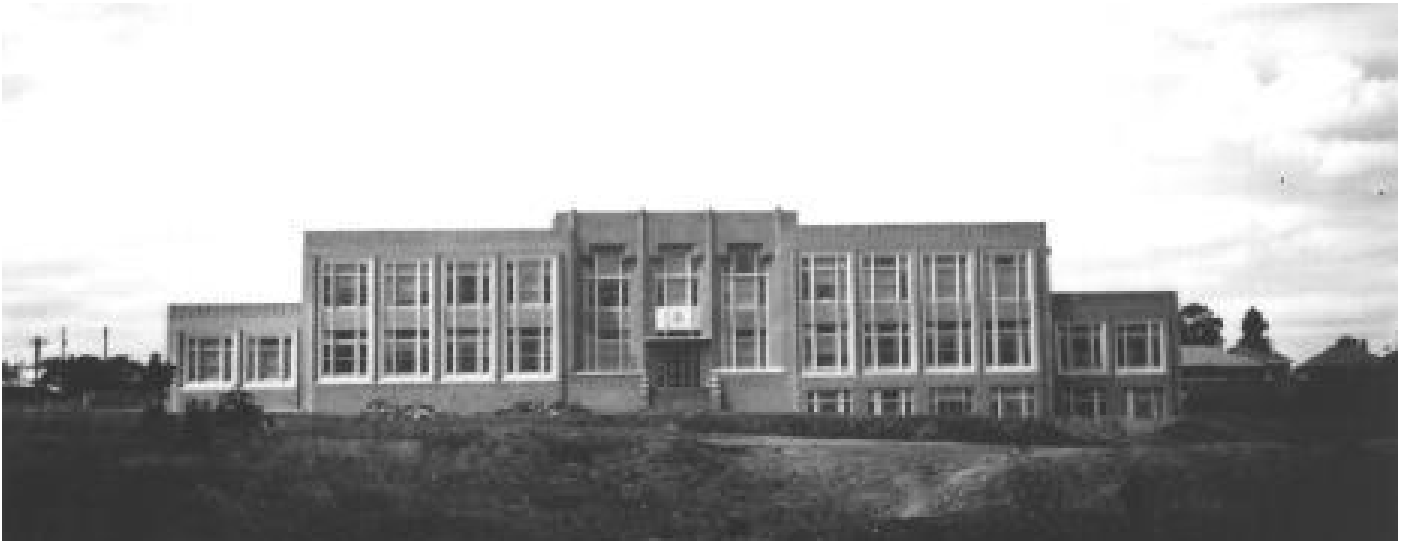
Camberwell High School, 1942