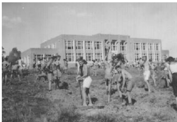
Digging air-raid trenches, 1942

I went to Box Hill High School with my friends where we stayed until Form 5 (Year 11) 1945. By 1945, the war was coming to an end and the Services had vacated the school buildings. MacRob and Melbourne Boys' High School