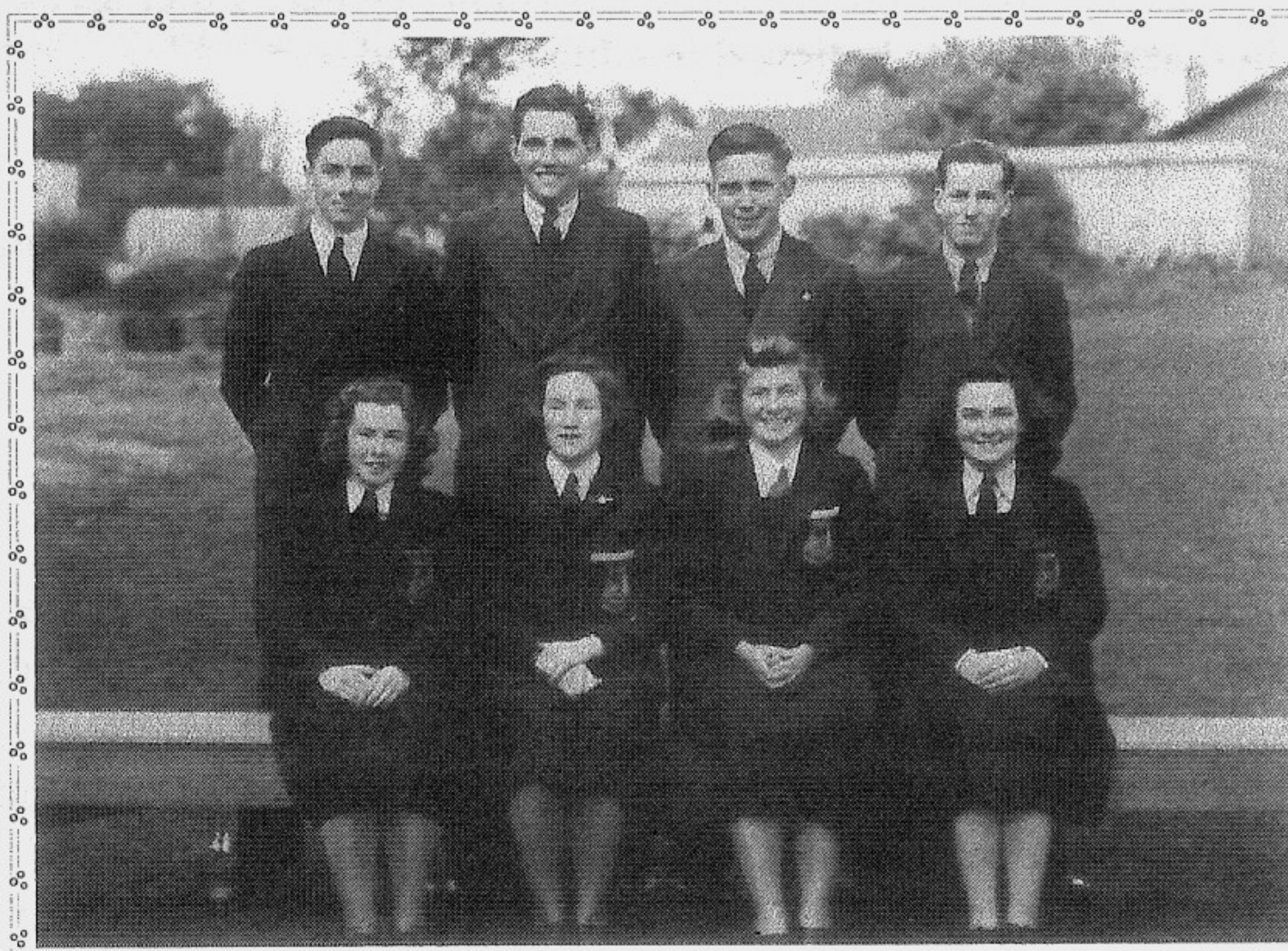
The author is standing second from the left in this 1947 House Captains photo. The order of houses are from left to right: Montgomery, Roosevelt, Churchill and Macarthur.