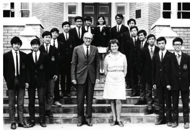
Asian students, 1970

https://camhigh.exstudents.org/1970-1979-potted-history/