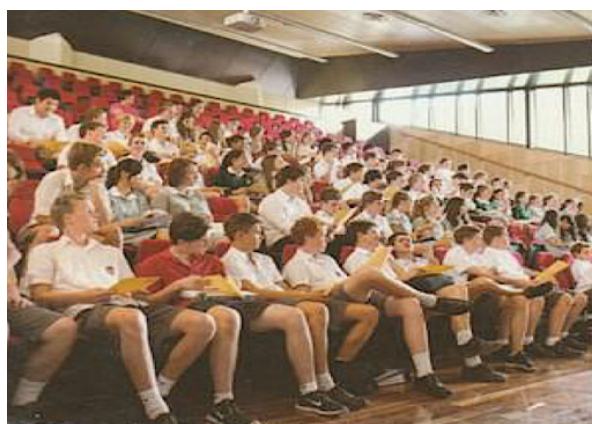
Year 9 students in the Enterprise Centre.

https://camhigh.exstudents.org/2010-2018-potted-history/