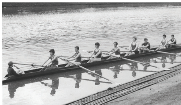
1st Eight, Rowing regatta, 1969

https://camhigh.exstudents.org/1960-1969-potted-history/