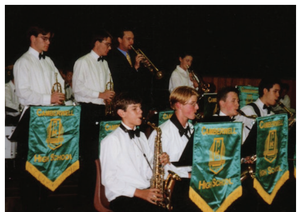
Tasmanian Music Tour, 1999

https://camhigh.exstudents.org/1990-1999-potted-history/