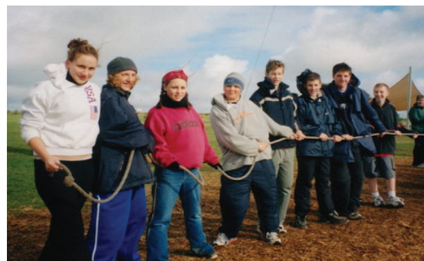
Year 9 camp at Lake Nillahcootie, 1982

https://camhigh.exstudents.org/1980-1989-potted-history/