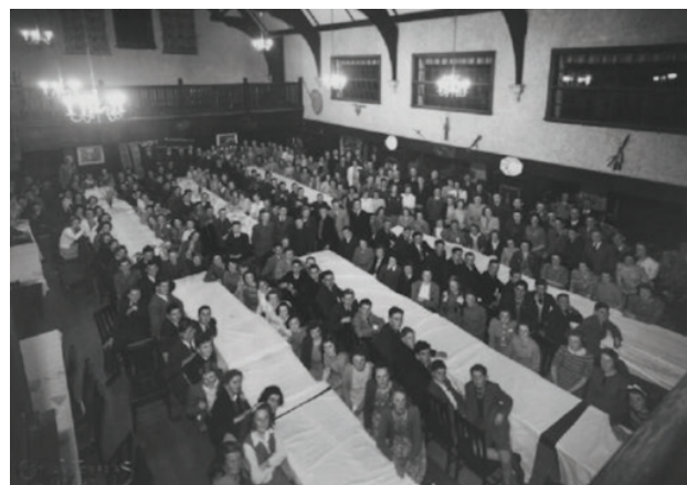
Warragul High and Camberwell High students at Wattle Park Chalet, 1948

https://camhigh.exstudents.org/1950-1959-potted-history